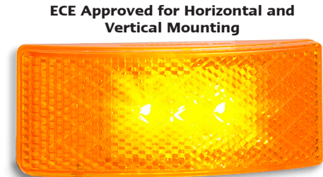
Part Number EU38AMHD - Blister Single EU38AMHDB - Bulk poly bag