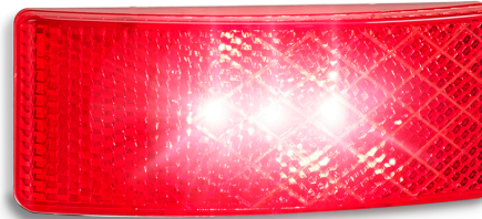
Part Number EU38RMHD - Blister Single EU38RMHDB - Bulk poly bag