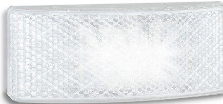
Part Number EU38WMHD - Blister Single EU38WMHDB - Bulk poly bag